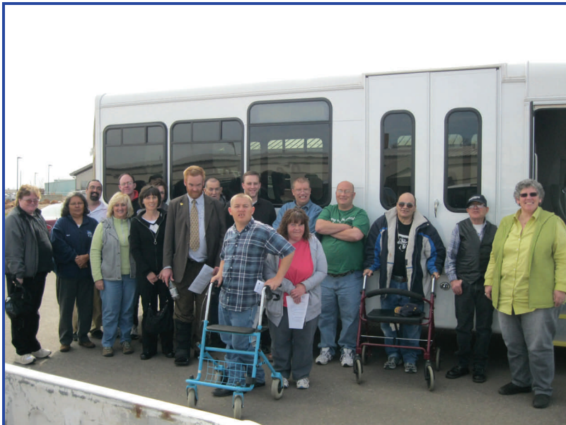
Council members and self-advocates in the Uintah Basin celebrate the beginning of Eastern Utah's shuttle service between the towns of Roosevelt, Duchesne, and Vernal.

Creating opportunities for people with developmental disabilities to have real jobs and real wages was an important goal emphasized throughout this final year of the 2007-2011 5-Year Plan. This goal will continue to be a major focus going into the Council's 2012-2016 5-Year plan. DD Council members and staff are involved with many ongoing workgroups that are focused on creating supported employment as well as self-employment opportunities.