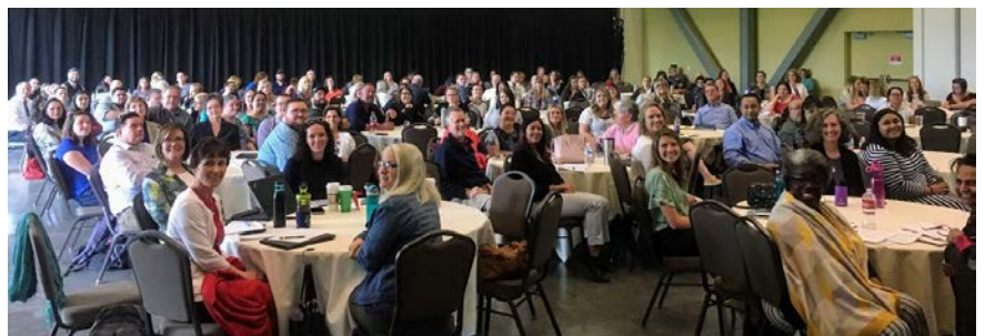
Attendees at the NADD “Mental Health and Disability Training” in June 2019.

Additionally, the UDDC funded a grant to support the mental health of people with Prader-Willi Syndrome and their siblings through individual support and professional development for clinicians. Over a 60-day period, Prader-Willi Syndrome Utah Association trained more than 55 people including family members and professionals.